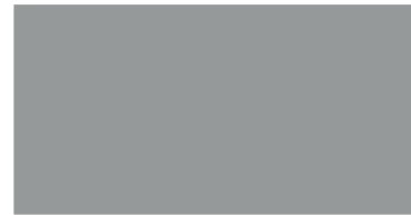
OLD TOWN GRAY